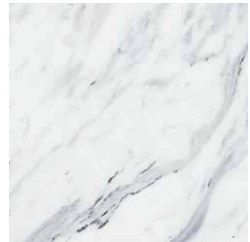
Calcutta Marble 4925

Wilsonart® SOLICOR™ Laminate Specs: Thickness Type 160: 0.048" +/- 0.005" Size: 4' x 8' Finishes: -38